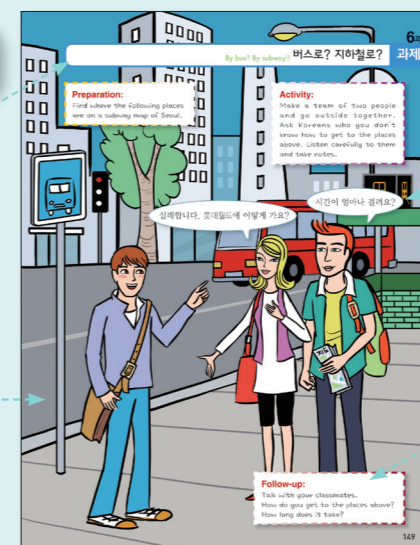
Illustration The topic is clearly represented through a picture.

Sample Sentences Sample sentences are provided for students' reference during the task.